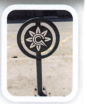
A new bike rack in Portage la Prairie